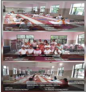
flexibility, strength, mental peace, and overall health. The practical session included demonstrations and guided practices of various yoga asanas, pranayama techniques, and relaxation exercises. Special emphasis was laid on simple and effective yoga practices that can be easily adopted by women to improve their physical fit-

Jammu, June 3: As part of the ongoing activities under the International Day of Yoga (IDY) 2026 campaign, the Regional Ayurveda Research Institute (RARI), Jammu, organised a Yoga Awareness and Practice Programme for women at Aap Shambhu Mandir, Roop Nagar, Jammu, on 3rd June 2026. The programme was conducted under the theme "Yoga for Healthy Ageing" with the objective of promoting physical, mental, and emotional well-being among women through the practice of yoga. The session witnessed enthusiastic participation from women of different age groups from the local community. The programme commenced with an introduction to the significance of yoga in maintaining a healthy lifestyle and preventing lifestyle-related disorders. Participants were informed about the benefits of incorporating yoga into their daily routine for enhancing